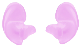
Custom Molded Impressions